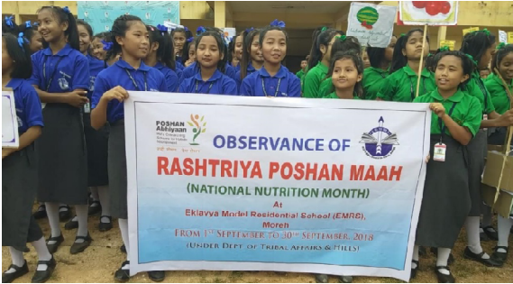
IT News Imphal, Sept 19

Under the Department of Tribals and Hills the National Nutrition Month which is conducting all over India under the theme of Rashtriya Poshan Maah is also conducted at Moreh by Eklaviya Model Residential School Moreh.